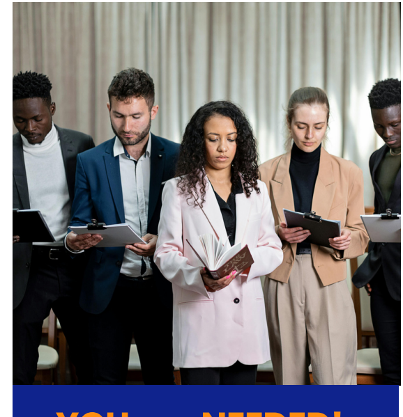
YOU are NEEDED!